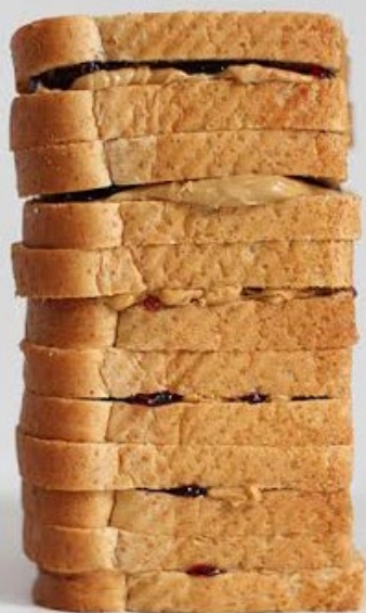
peanut butter & jelly sandwiches FOR THE FREEZER